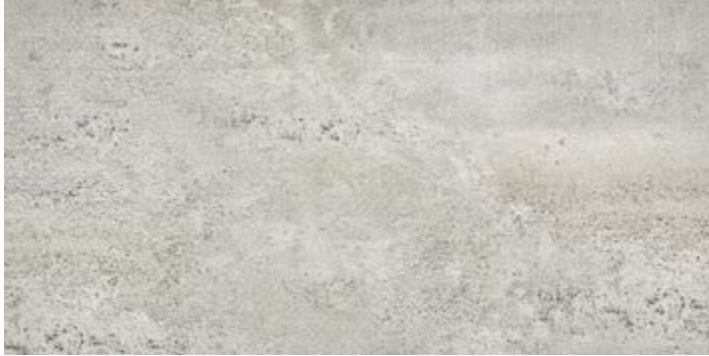
TERP9366 12" x 24" Tibet Beige 27