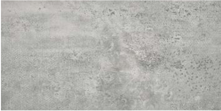
TERP9380 12" x 24" Tibet Light Grey 27