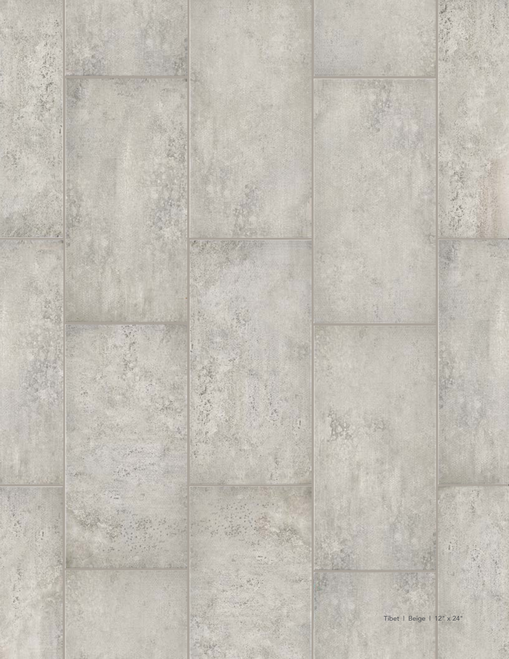
Tibet | Beige | 12" x 24"