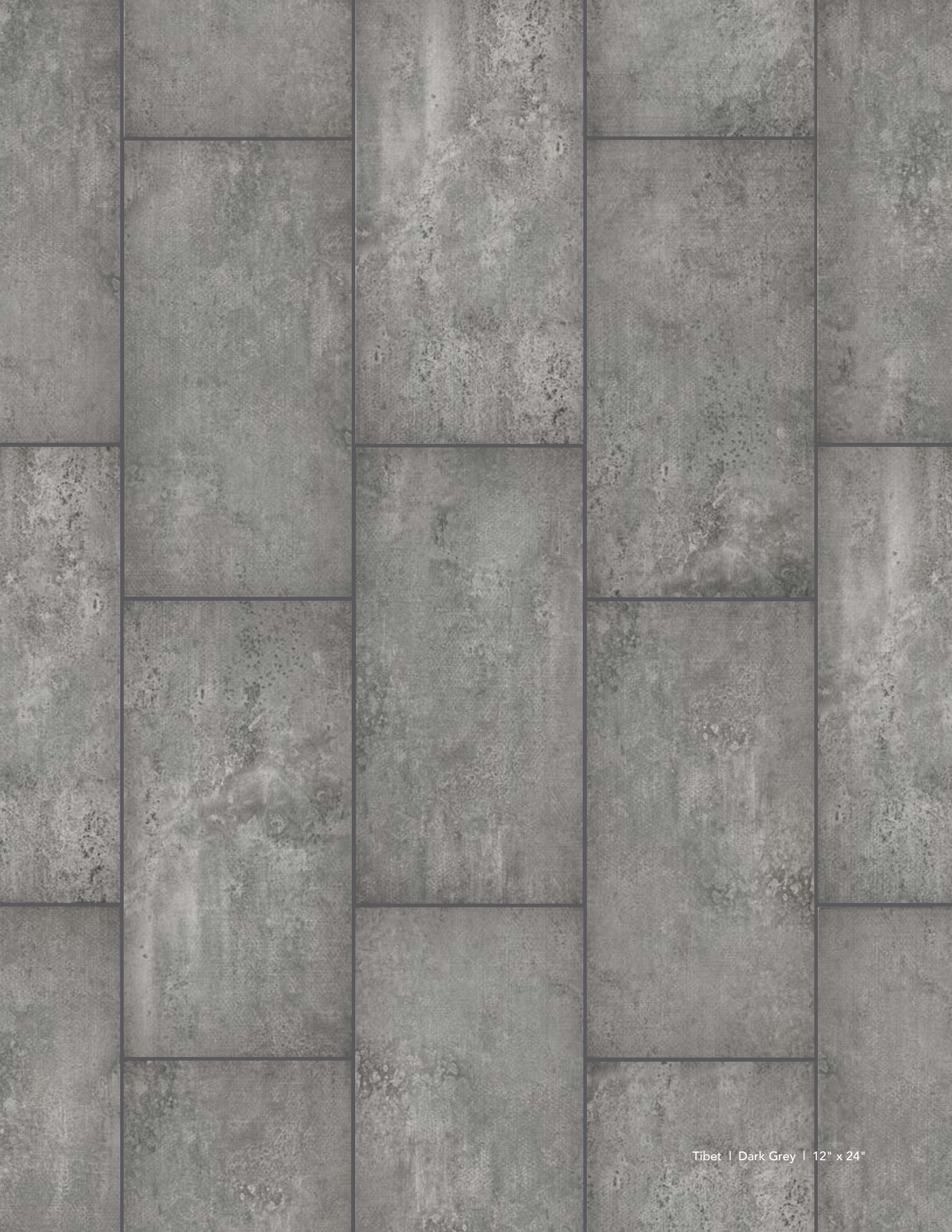
Tibet | Dark Grey | 12" x 24"