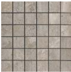
TERM8731 2" x 2" Tibet Brown Mosaic 11.75" x 11.75" Mesh - 0.959 Sqft/Sheet 187