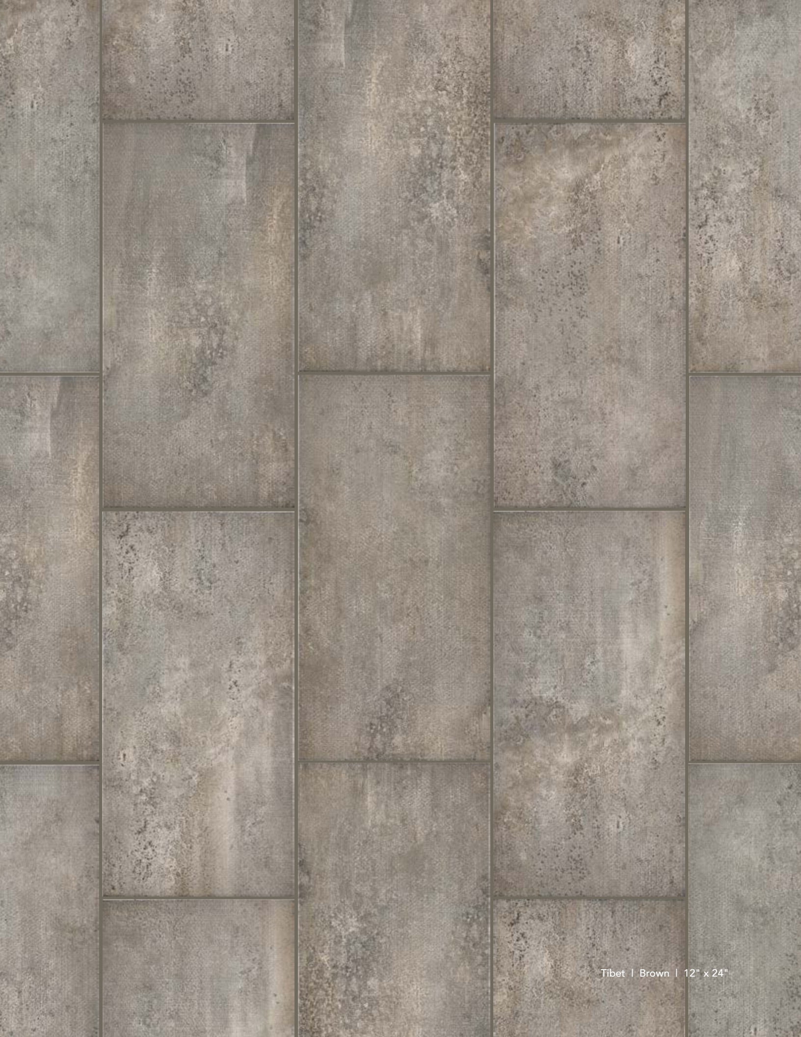
Tibet | Brown | 12" x 24"