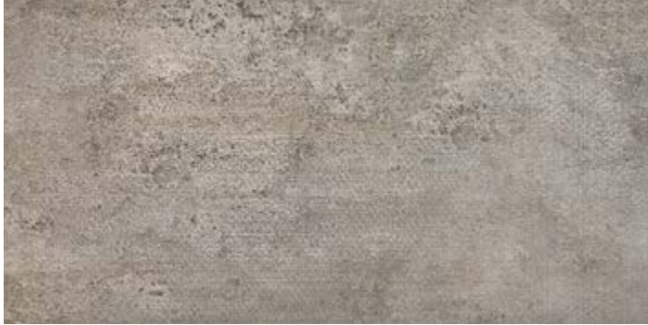
TERP9373 12" x 24" Tibet Brown 27