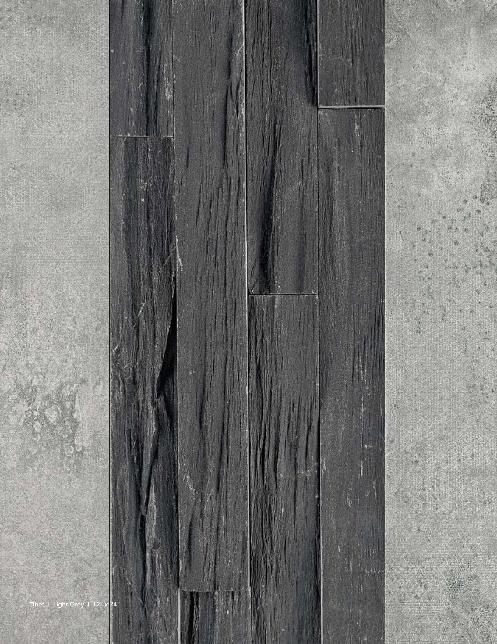
Tibet | Light Grey | 12" x 24"