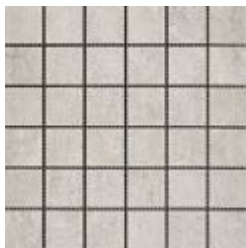
TERM8385 2" x 2" Tibet Beige Mosaic 11.75" x 11.75" Mesh - 0.959 Sqft/Sheet 187