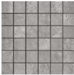
TERM8079 2" x 2" Tibet Dark Grey Mosaic 11.75" x 11.75" Mesh - 0.959 Sqft/Sheet 187