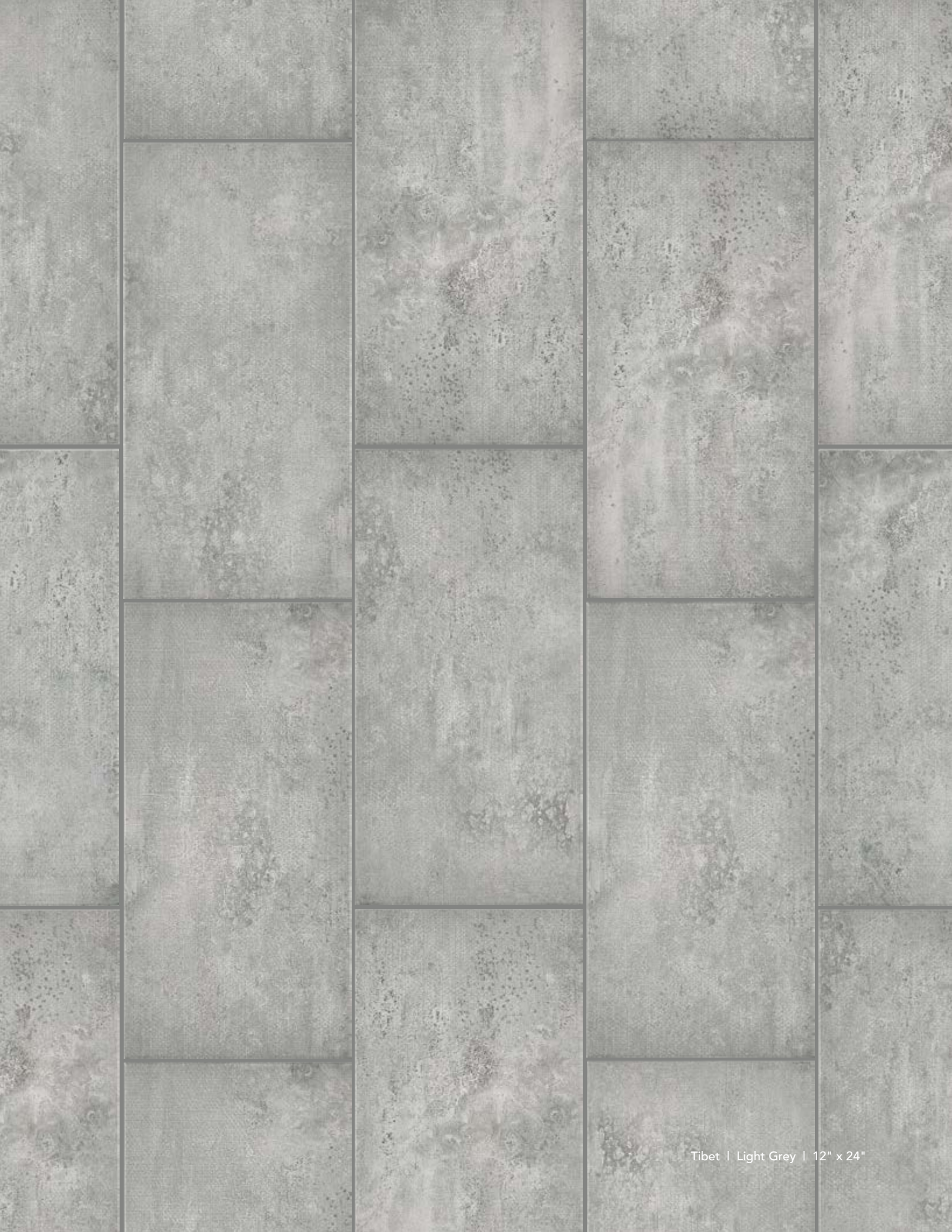
Tibet | Light Grey | 12" x 24"