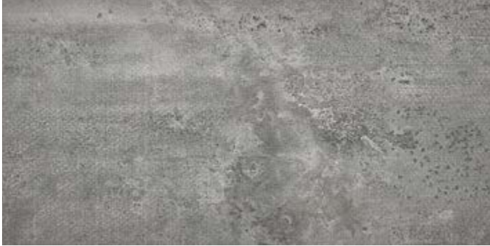
TERP9397 12" x 24" Tibet Dark Grey 27