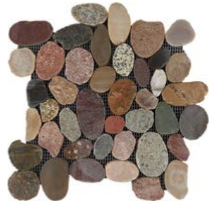
R445002 Congo Pebble Honed Sliced 12" x 12" Mesh - 1 Sqft/Sheet