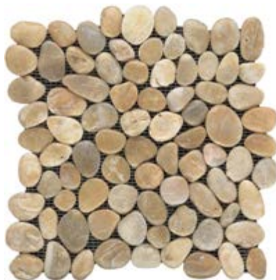
R444501 Citrine Pebble Super Polished 12" x 12" Mesh - 1 Sqft/Sheet