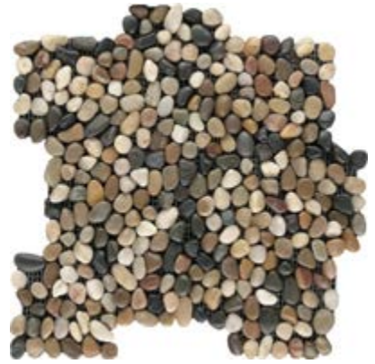
R444803 Rio Blend Pebble Honed 12" x 12" Mesh - 1 Sqft/Sheet