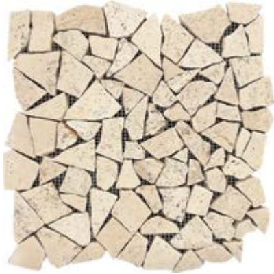
T121993 Ivory Paledien Tumbled 12" x 12" Mesh - 1 Sqft/Sheet