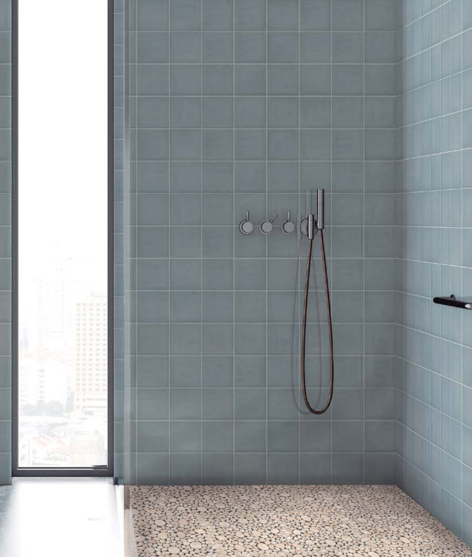
Glass Pebbles | Panama Borriana | Light Blue | 5" x 5"