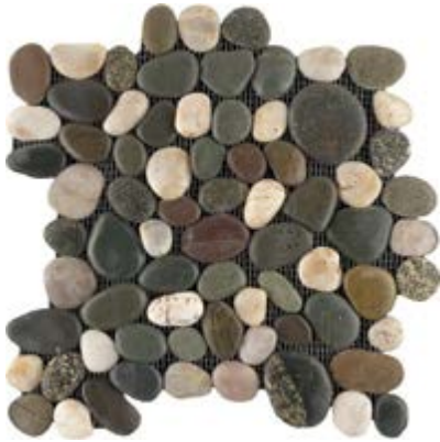
R445110 Niagara Pebble Honed 12" x 12" Mesh - 1 Sqft/Sheet