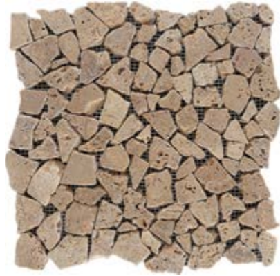
T131993 Noche Paledien Tumbled 12" x 12" Mesh - 1 Sqft/Sheet