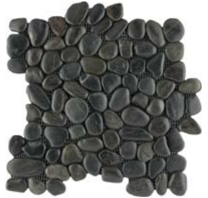
R444403 Volga Black Pebble Honed 12" x 12" Mesh - 1 Sqft/Sheet