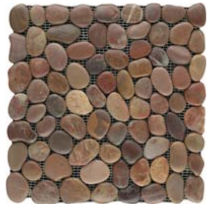
R444303 Marlow Red Pebble Honed 12" x 12" Mesh - 1 Sqft/Sheet