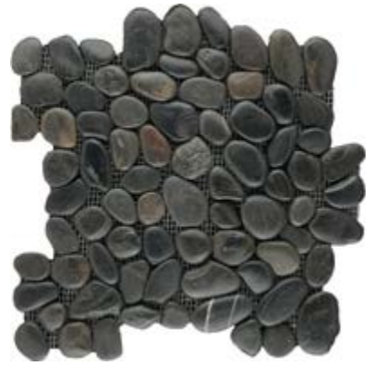
R445103 Dark Green Pebble Honed 12" x 12" Mesh - 1 Sqft/Sheet