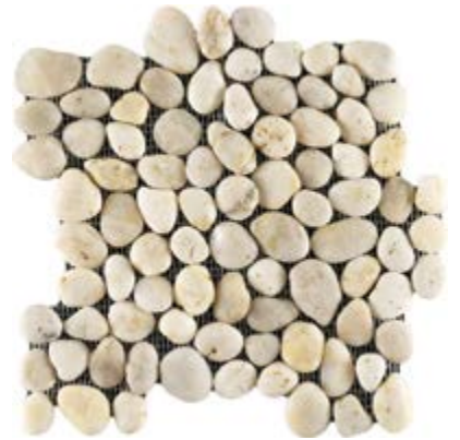
R444603 Pearl White Pebble Honed 12" x 12" Mesh - 1 Sqft/Sheet