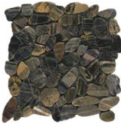
R444702 Tiger Eye Pebble Super Polished Sliced 12" x 12" Mesh - 1 Sqft/Sheet