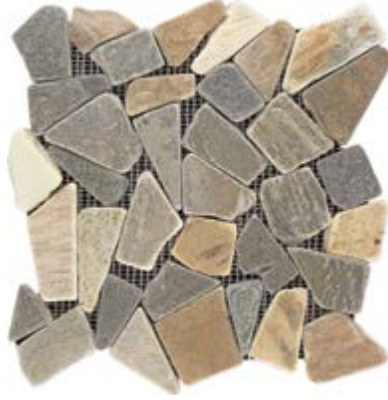
T522022 Tuscany Quartzite Paledien Tumbled 12" x 12" Mesh - 1 Sqft/Sheet