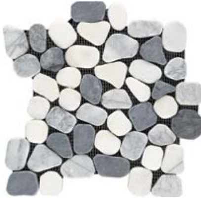
M332912 White-Black Paledien Tumbled 12" x 12" Mesh - 1 Sqft/Sheet