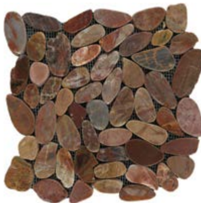
R444302 Marlow Red Pebble Super Polished Sliced 12" x 12" Mesh - 1 Sqft/Sheet