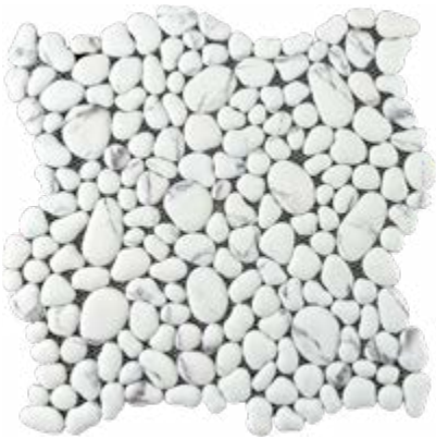
MSTO2201 Aspen Snow Glass Pebbles 12" x 12" Mesh - 1 Sqft/Sheet