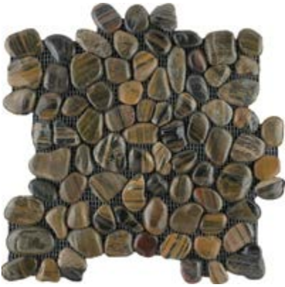
R444701 Tiger Eye Pebble Super Polished 12" x 12" Mesh - 1 Sqft/Sheet