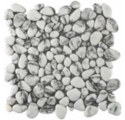
MSTO2103 Cold Bay Glass Pebbles 12" x 12" Mesh - 1 Sqft/Sheet