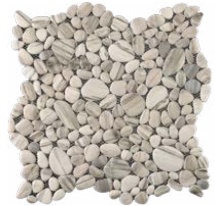
MSTO2203 Yuma Glass Pebbles 12" x 12" Mesh - 1 Sqft/Sheet