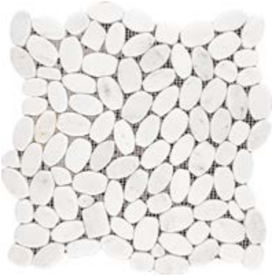
M623500 Bianco Carrara Paledien Tumbled 12" x 12" Mesh - 1 Sqft/Sheet