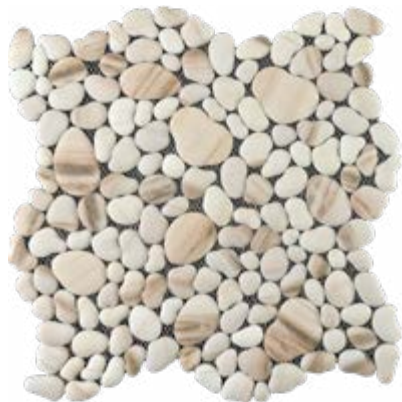
MSTO2205 Santa Fe Glass Pebbles 12" x 12" Mesh - 1 Sqft/Sheet