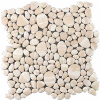
MSTO2204 Panama Glass Pebbles 12" x 12" Mesh - 1 Sqft/Sheet