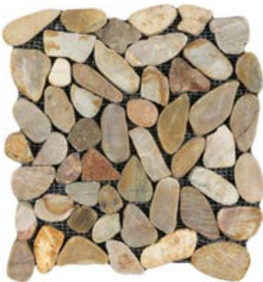
R444744 Sand Dune Pebble Honed Sliced 12" x 12" Mesh - 1 Sqft/Sheet