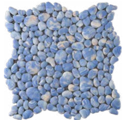
MSTO2206 Memphis Glass Pebbles 12" x 12" Mesh - 1 Sqft/Sheet