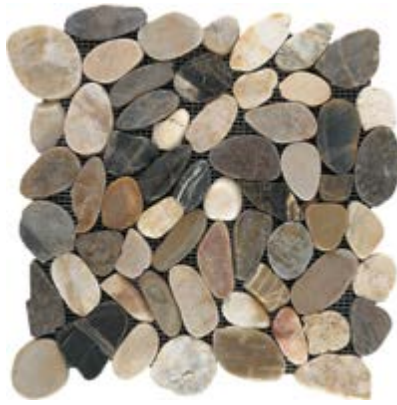
R444802 Rio Blend Pebble Super Polished Sliced 12" x 12" Mesh - 1 Sqft/Sheet