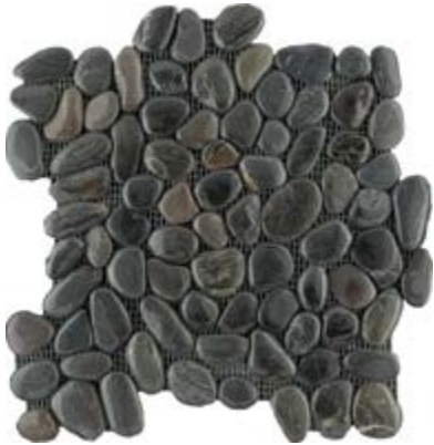
R444401 Volga Black Pebble Super Polished 12" x 12" Mesh - 1 Sqft/Sheet