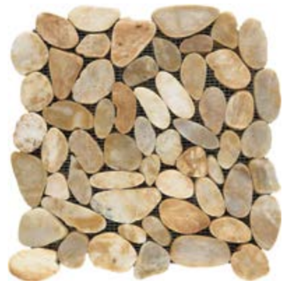
R444502 Citrine Pebble Super Polished Sliced 12" x 12" Mesh - 1 Sqft/Sheet