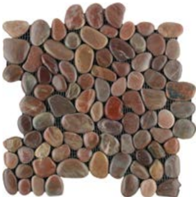
R444301 Marlow Red Pebble Super Polished 12" x 12" Mesh - 1 Sqft/Sheet