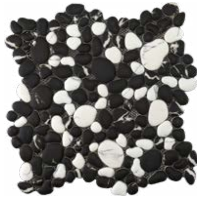
MSTO2202 Tuxedo Glass Pebbles 12" x 12" Mesh - 1 Sqft/Sheet