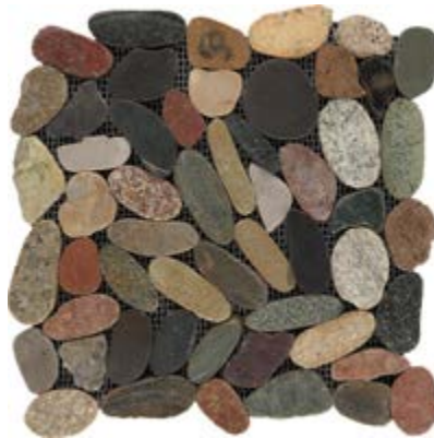
R445102 Savannah Pebble Honed Sliced 12" x 12" Mesh - 1 Sqft/Sheet