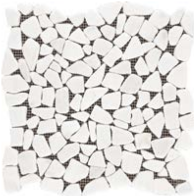
M332992 White Marble Paledien Tumbled 12" x 12" Mesh - 1 Sqft/Sheet