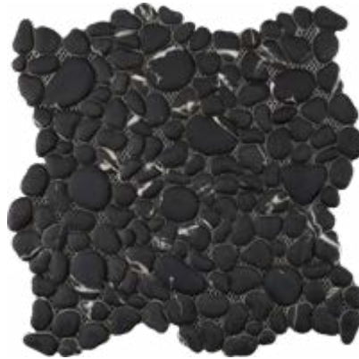
MSTO2102 Kehena Glass Pebbles 12" x 12" Mesh - 1 Sqft/Sheet