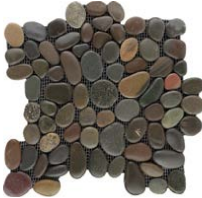
R445220 Madison Pebble Honed 12" x 12" Mesh - 1 Sqft/Sheet