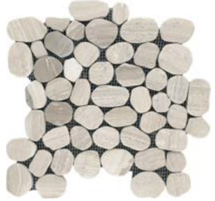
M638400 Wooden White Paledien Tumbled 12" x 12" Mesh - 1 Sqft/Sheet