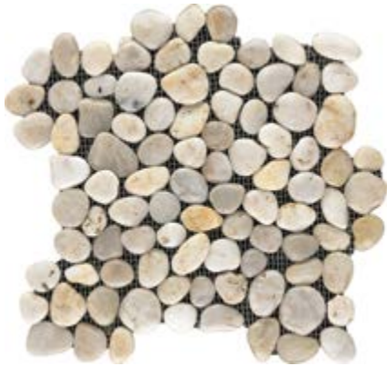
R444601 Pearl White Pebble Super Polished 12" x 12" Mesh - 1 Sqft/Sheet