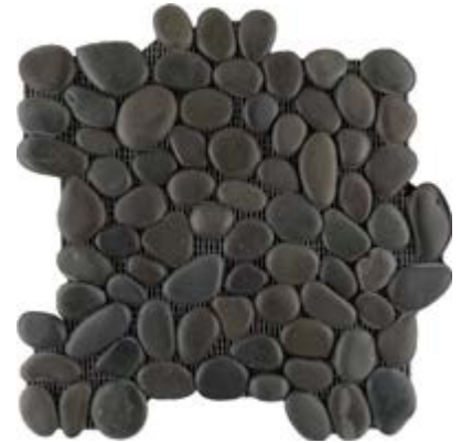
R445330 Charcoal Pebble Honed 12" x 12" Mesh - 1 Sqft/Sheet