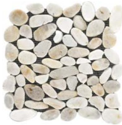
R444602 Pearl White Pebble Super Polished Sliced 12" x 12" Mesh - 1 Sqft/Sheet