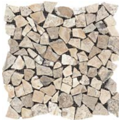
O391993 Antik Onyx Paledien Tumbled 12" x 12" Mesh - 1 Sqft/Sheet