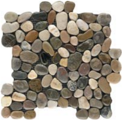
R444801 Rio Blend Pebble Super Polished 12" x 12" Mesh - 1 Sqft/Sheet