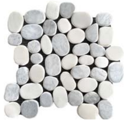
M432717 White-Grey Paledien Tumbled 12" x 12" Mesh - 1 Sqft/Sheet