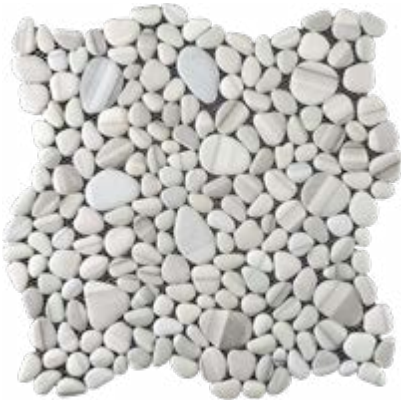
MSTO2301 Salt Flats Glass Pebbles 12" x 12" Mesh - 1 Sqft/Sheet