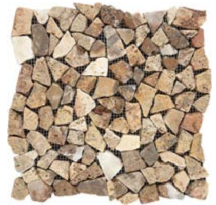
T252227 Scabos Paledien Tumbled 12" x 12" Mesh - 1 Sqft/Sheet