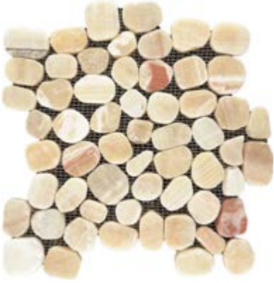
M791531 Pineapple Onyx Paledien Tumbled 12" x 12" Mesh - 1 Sqft/Sheet