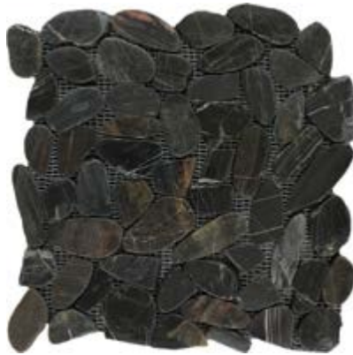
R444402 Volga Black Pebble Super Polished Sliced 12" x 12" Mesh - 1 Sqft/Sheet