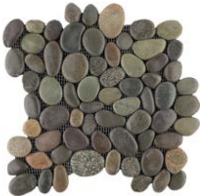
R445101 Savannah Pebble Honed 12" x 12" Mesh - 1 Sqft/Sheet