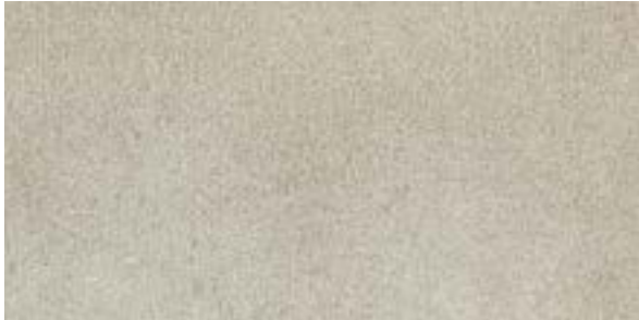
TMAX0732 12" x 24" Matrix Beige Rect 29