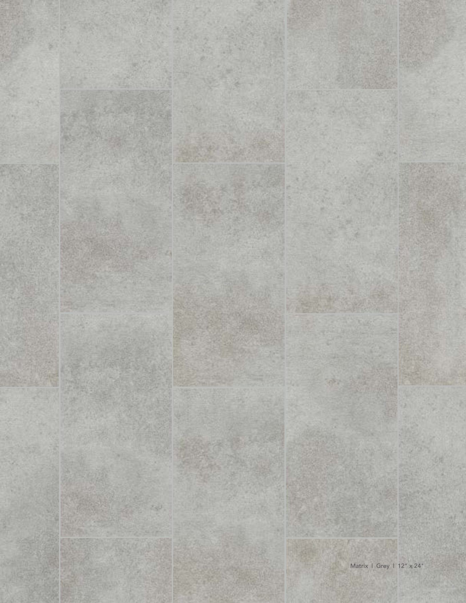
Matrix | Grey | 12" x 24"