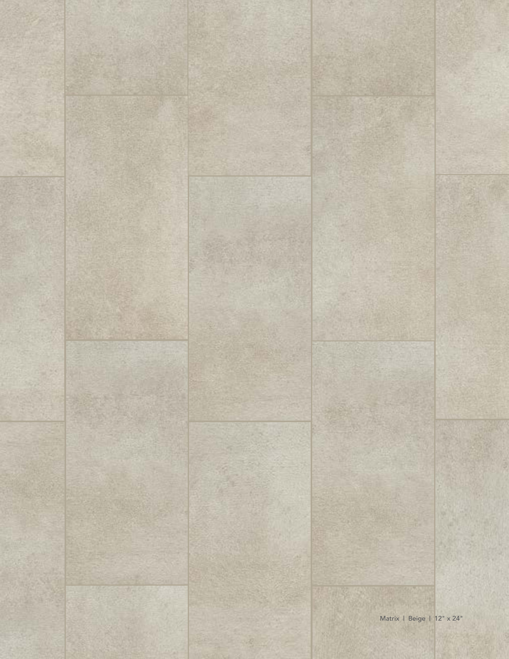
Matrix | Beige | 12" x 24"