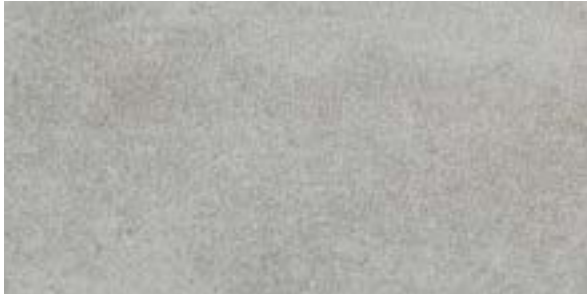
TMAX8905 12" x 24" Matrix Grey Rect 29