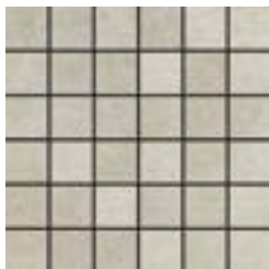
TMAX8890 2" x 2" Matrix Beige Mosaic 11.75" x 11.75" Mesh - 0.959 Sqft/Sheet 187