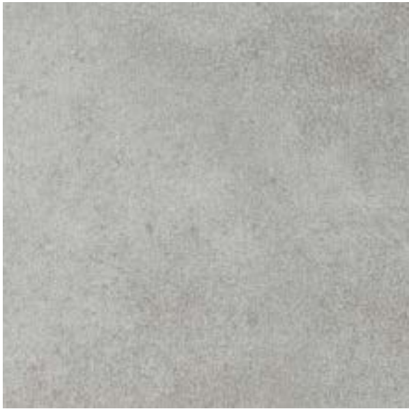
TMAX4850 24" x 24" Matrix Grey Rect 44