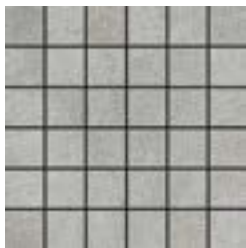
TMAX2750 2" x 2" Matrix Grey Mosaic 11.75" x 11.75" Mesh - 0.959 Sqft/Sheet 187