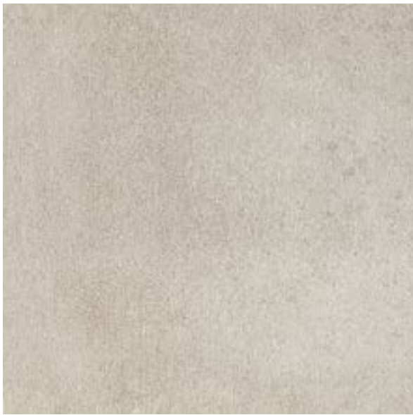
TMAX1988 24" x 24" Matrix Beige Rect 44