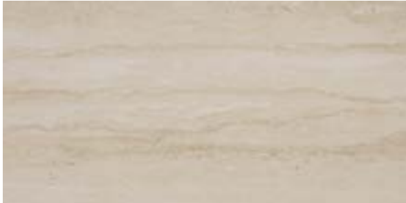
TMHM5302 12" x 24" Malham Beige 25