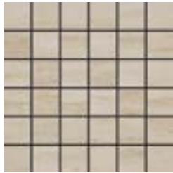
TMHM9194 2" x 2" Malham Beige Mosaic 11.75" x 11.75" Mesh - 0.959 Sqft/Sheet 192