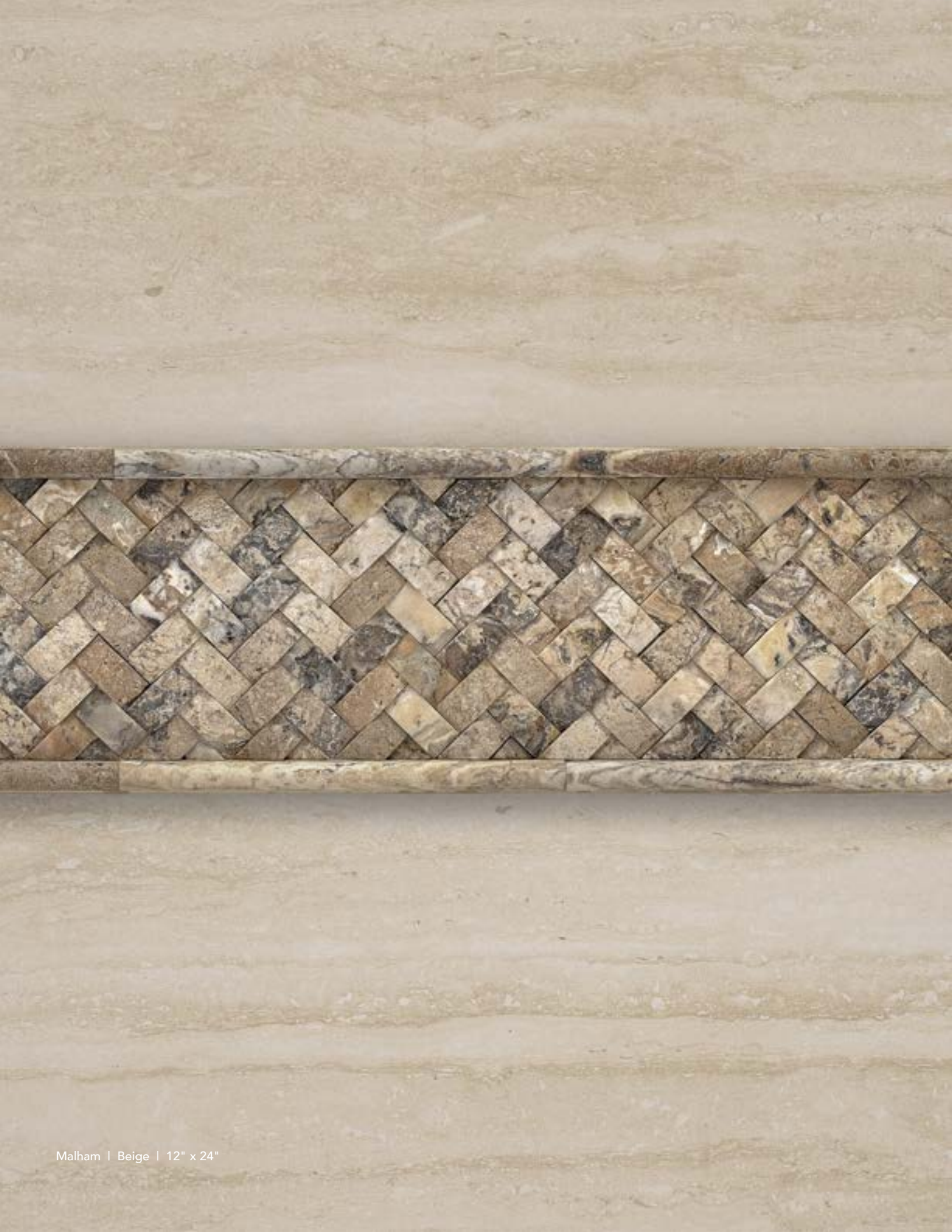
Malham | Beige | 12" x 24"