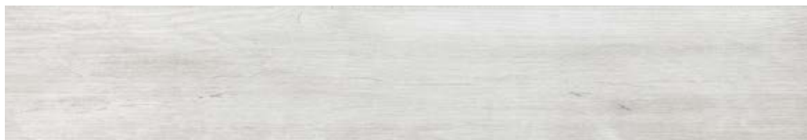
TLEG3188 8" x 48" Legno Chiaro White 36