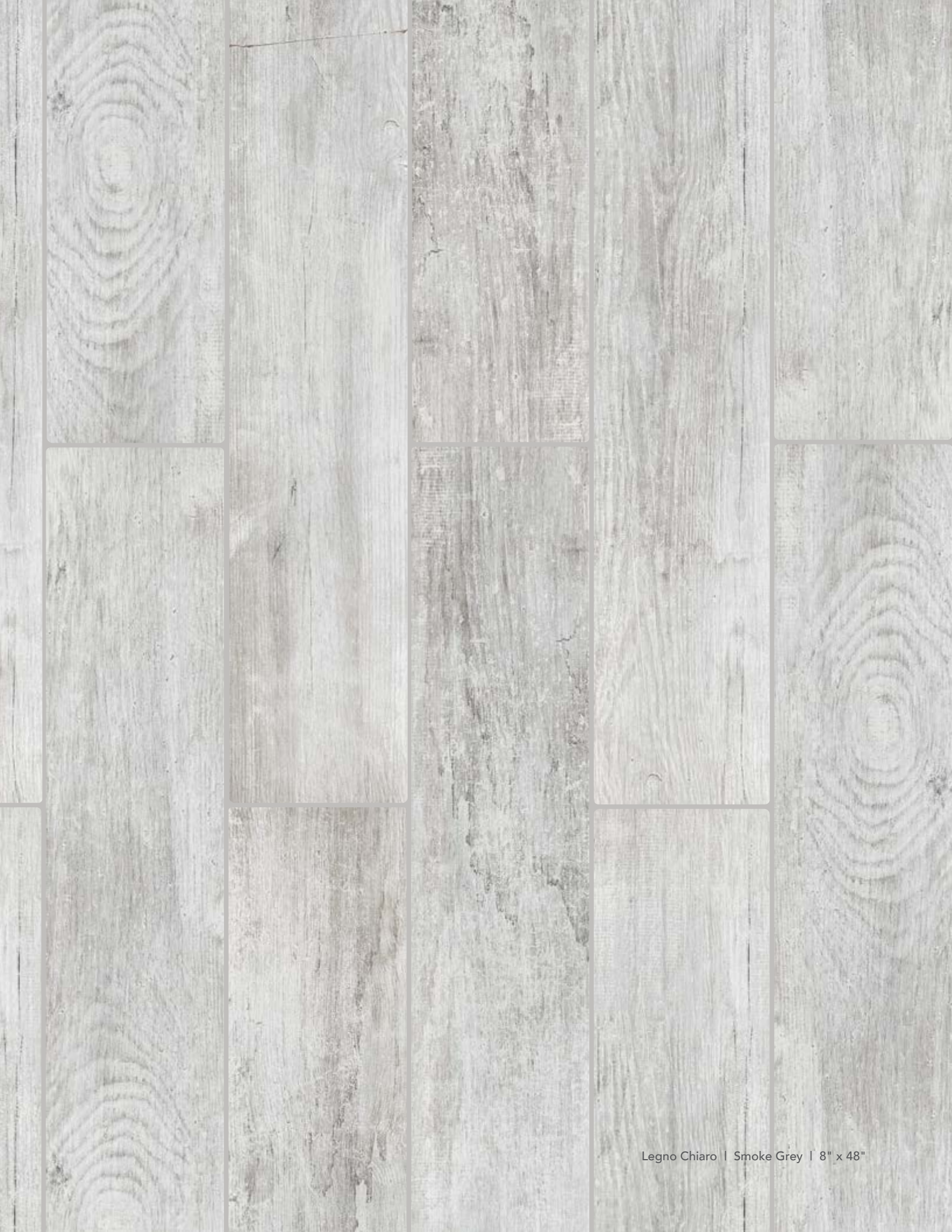
Legno Chiaro | Smoke Grey | 8" x 48"