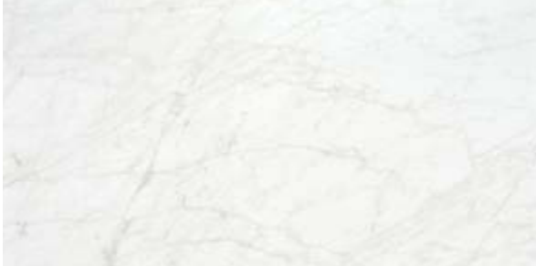
HLY290 12" x 24" Carrara Rect Matt 36