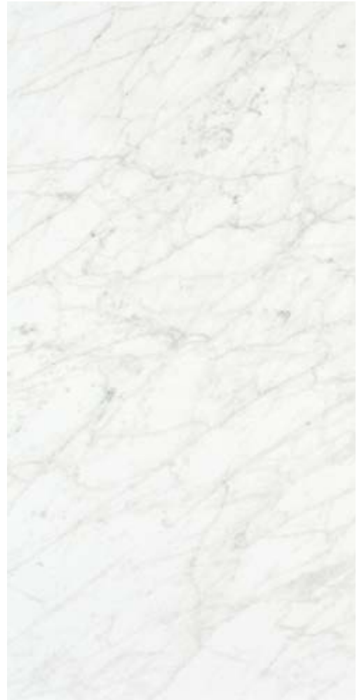
HLY221 24" x 48" Carrara Rect Matt 44