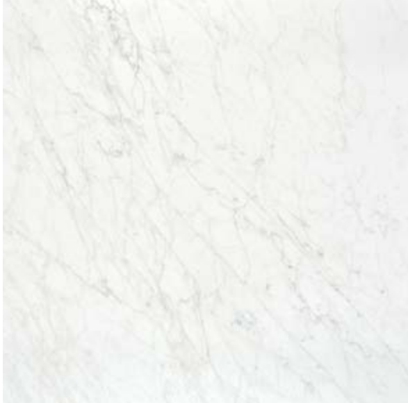
HLY309 24" x 24" Carrara Rect Matt 38