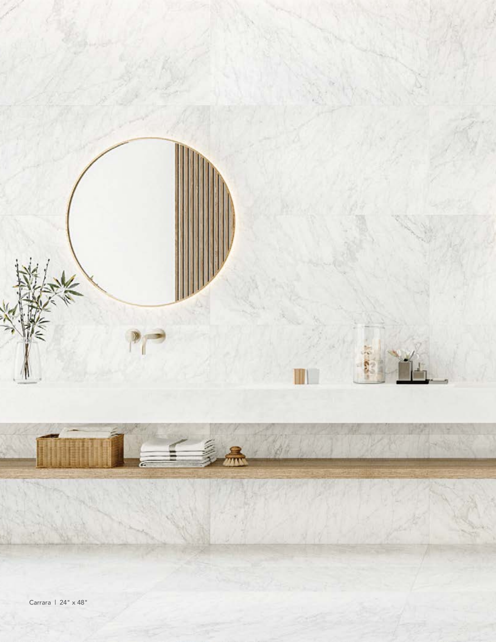
Carrara | 24" x 48"